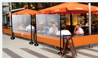
Outdoor Dining Patio with Free-Standing Wall Partition