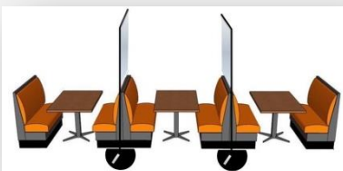
Double Booth Partition