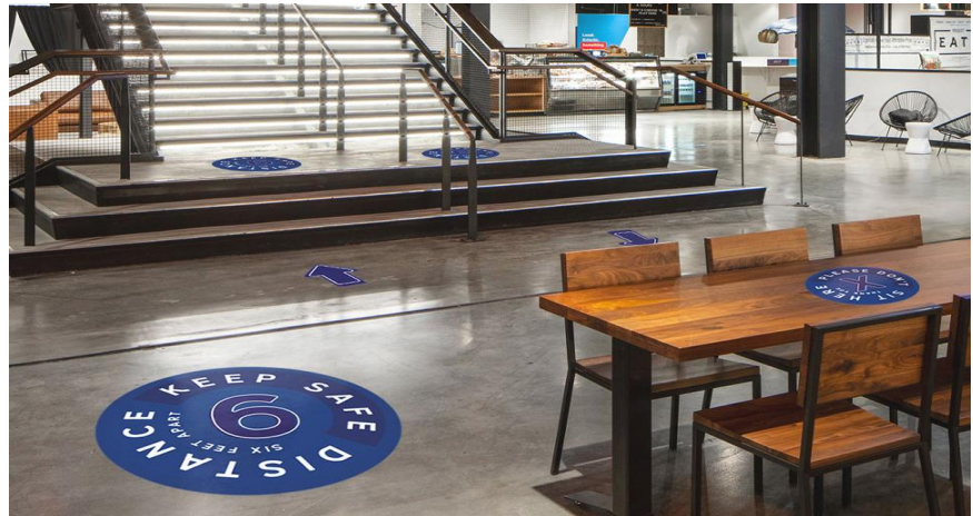
Suitable for Indoor: Floors · Walls · Counters